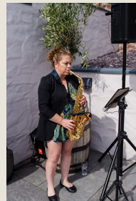
Saxona Saxophonist 1 hour sax before 6pm