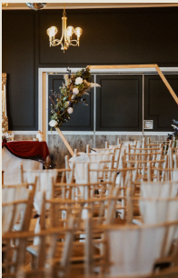
Table décor chosen from our in hour décor collection.

Final numbers and menu choices submitted 4 weeks before the wedding date.