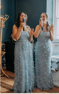
Sass Singers Singing during Welcome Drinks Option to add on Ceremony at an additional cost